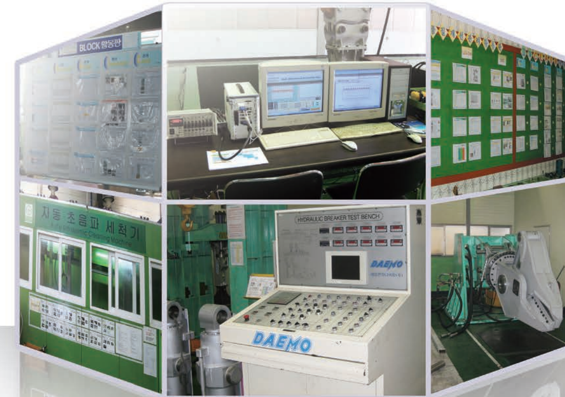
BMS Board & Ultra Sonic Machine